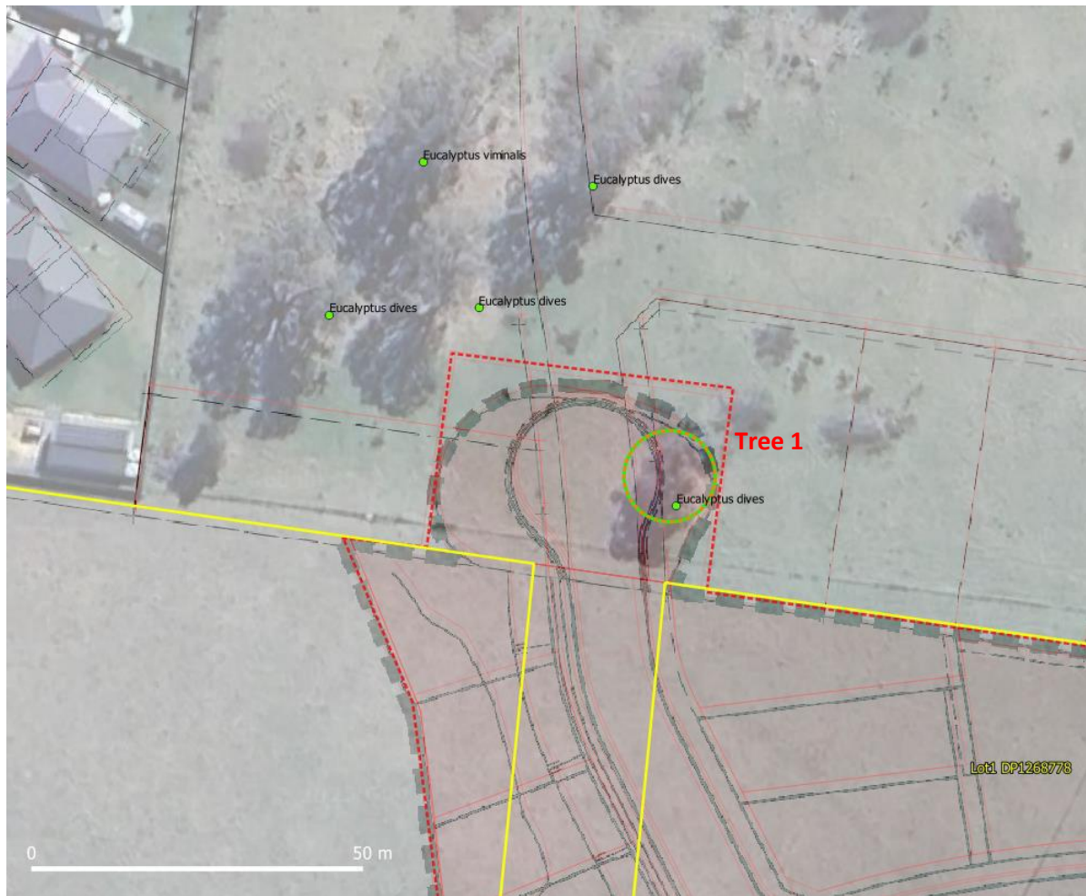
Tree 1, Location BDAR page 61